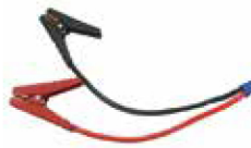
Jump cable & clamps